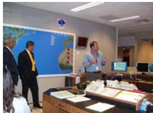
South Florida GRPIS Meeting

On May 28, 2009, the South Florida Chapter of the Governmentwide Real Property Information Sharing (GRPIS) Council met at the National Oceanic & Atmospheric Administration's (NOAA) National Hurricane Center (NHC) in Miami, Florida.