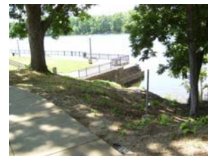
Black Warrior River